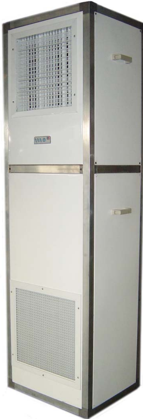
SARAVEL Hi-Rise Fan Coil